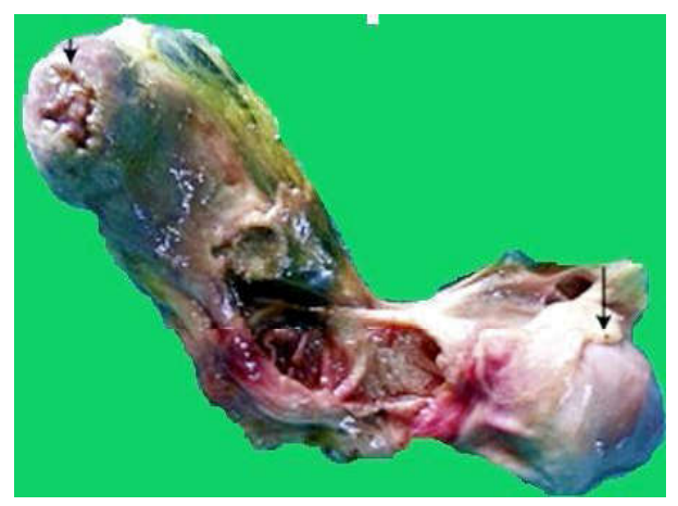
Fig. 1 : Bilobed gall bladder with wall thickening and gall stones. Arrow pointing towards peritoneal covering of one of the lobe

In 80% of the cases the capacity of gall bladder was ranging from 40 to 75ml, while in 12% of cases the capacity range was 25 to 40ml and in 7% of cases the capacity was around 80 to 120ml (Table 1). In 75% of cases the peritoneal investment on the non hepatic surface was 2/3^{\rm rd} to 3/4^{\rm th} , while in 13% of cases it was more than 3/4^{\rm th} and in 12% of cases it was less than 2/3^{\rm rd} (Table 1). In 57% of cases the fundus was inframarginal, while in 26% of cases it