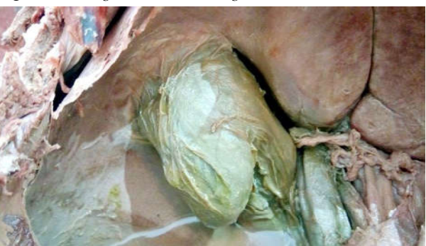
Fig. 3 : Gall bladder is distended by aqueous injection. Non hepatic surface completely covered by peritoneum and fundus is supramarginal